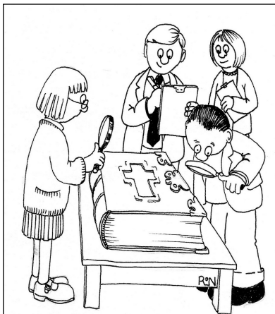
Every week they gathered for Bible Study

Trucks). For more info contact Julie Pinnell on juliepinnell@btconnect.com or 01892 863300.