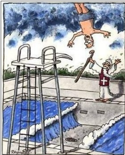
Moses' first and last day as a lifeguard.

* name changed for security reasons Information provided by Open Doors